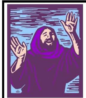
Jesus proclaimed the Good News: 'The Kingdom of God is at hand.'

Undertaking an important journey we must be well prepared. As we set out on our journey to Easter, we must be clear about the destination that gives meaning to this journey.